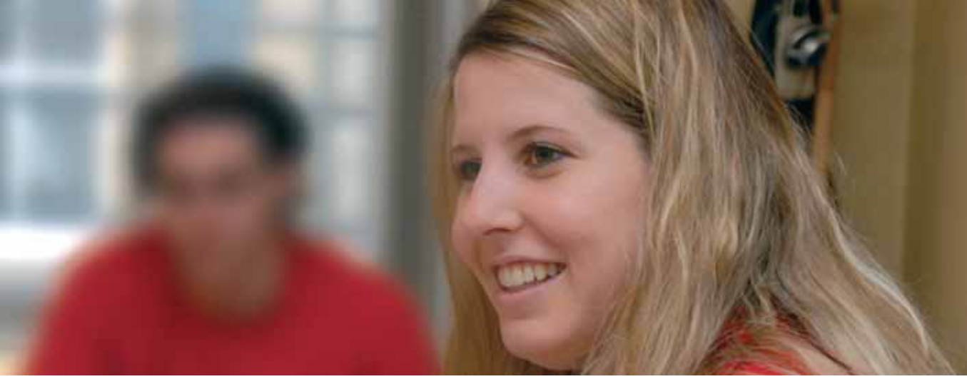
Pre-intermediate to Intermediate