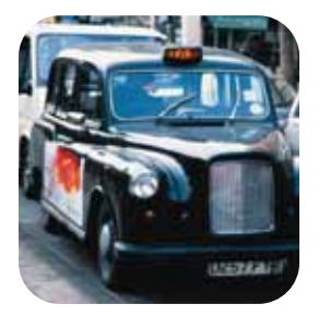
To make your journey easy, we can arrange for an individual transfer to your accommodation from all the major airports.